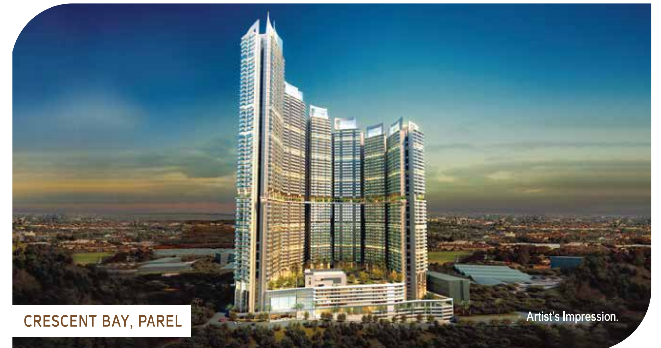
CRESCENT BAY, PAREL