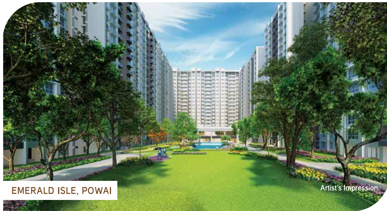
EMERALD ISLE, POWAI