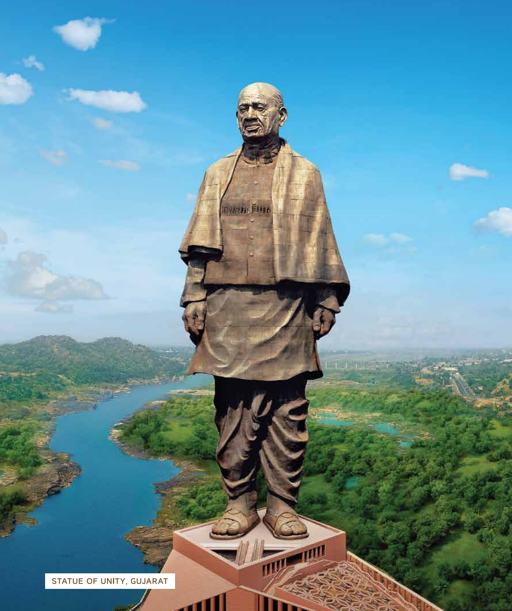
STATUE OF UNITY, GUJARAT