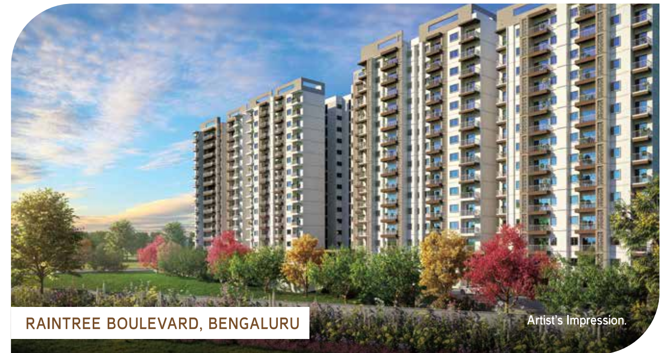
RAINTREE BOULEVARD, BENGALURU