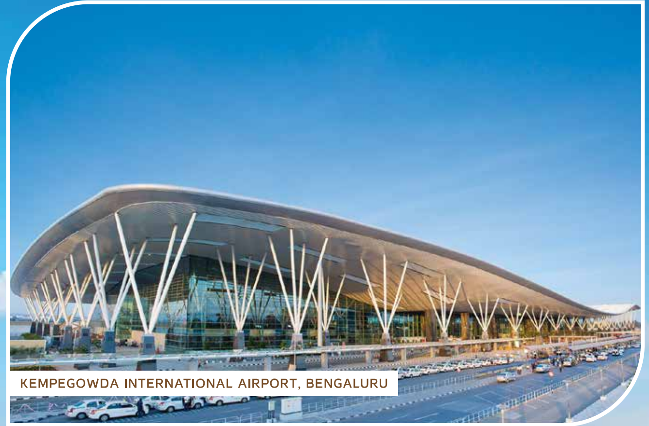
KEMPEGOWDA INTERNATIONAL AIRPORT, BENGALURU