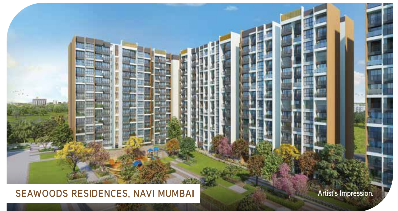
SEAWOODS RESIDENCES, NAVI MUMBAI