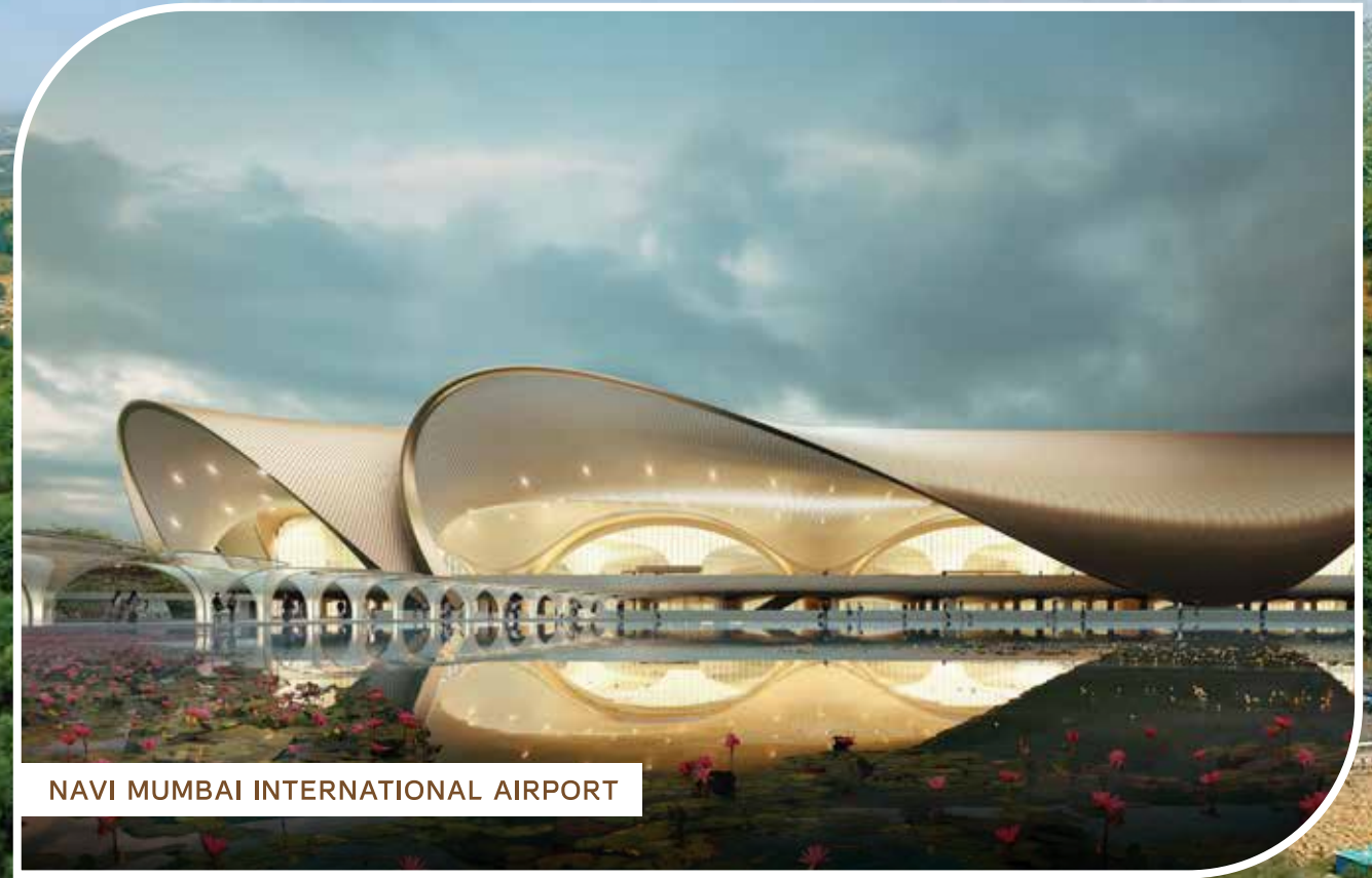
NAVI MUMBAI INTERNATIONAL AIRPORT