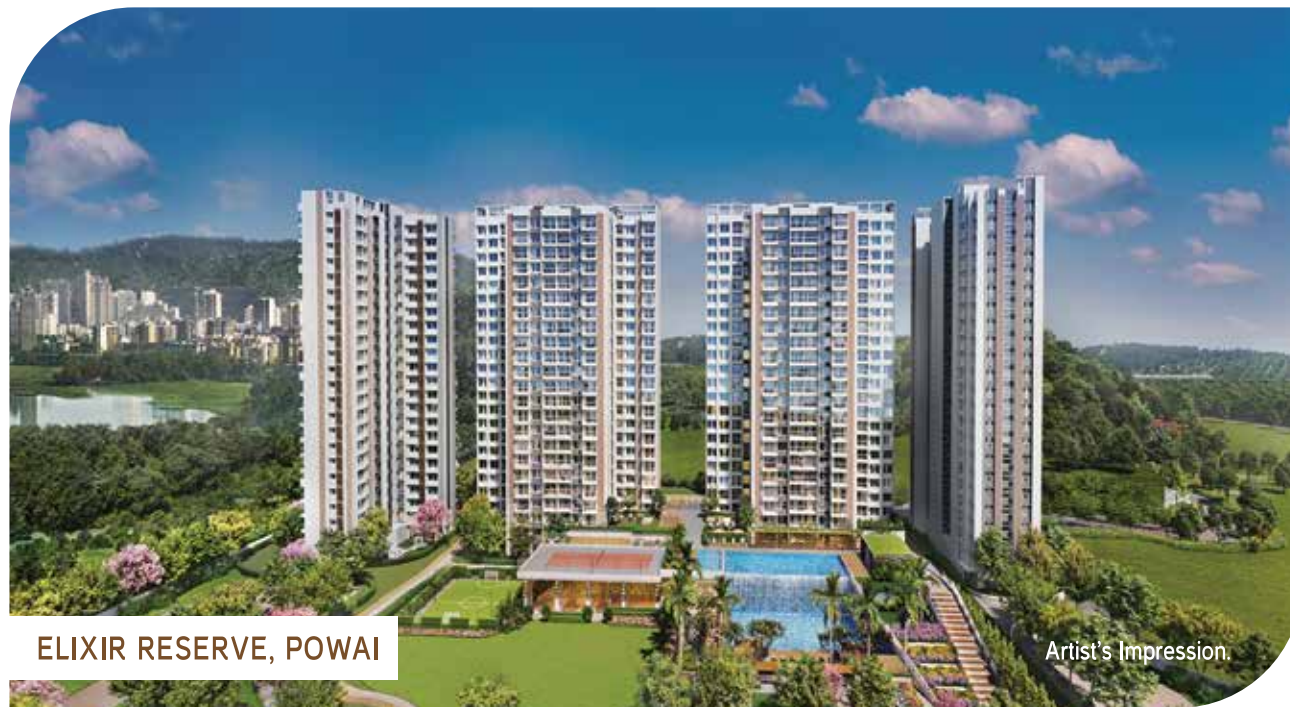
ELIXIR RESERVE, POWAI